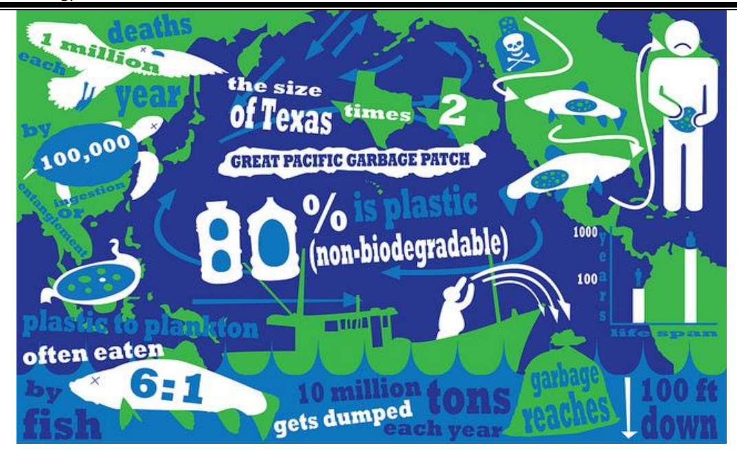
Figure 1: The impact of the garbage patch. Reference