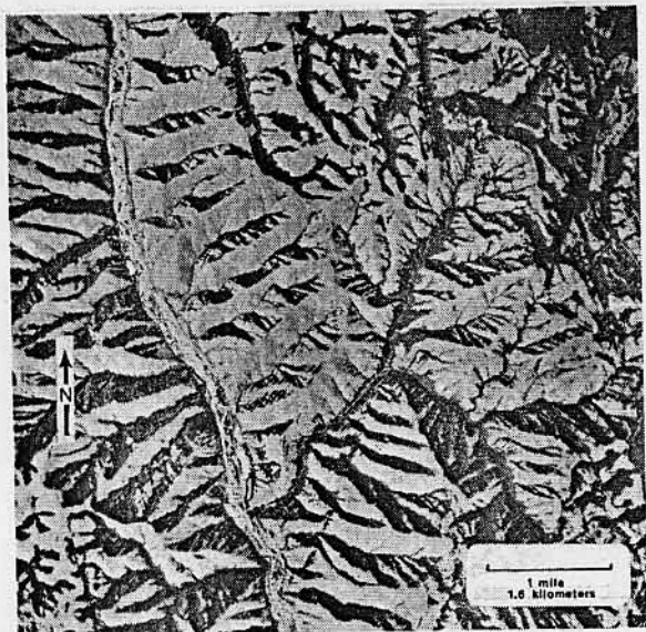
Figure 2.—An aerial photo of the Umatilla winter-range sampling area (area 2 in fig. 1 and table 1) illustrates typical canyon relief and shows the intermingled arrangement of forest and grassland communities.

The Blue Mountains consist of a large, arched syncline, uplifted from basalts of the Columbia Basin floor. At foothill elevations over about 3,000 feet (900 m) winter-range areas consist of north slopes covered with mixed pine-fir forest and south slopes with open bunchgrass and scattered pine (fig. 2).