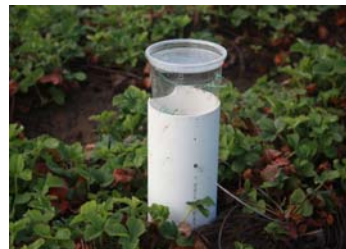
Trap placed with the aid of a PVC pipe in strawberry field.