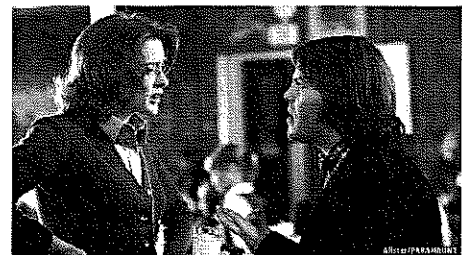
Mr Schneebly needs his feedback